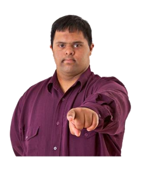
What can I do to help myself?

Website: <u>www.rethink.org</u> Telephone: 0121 522 7007